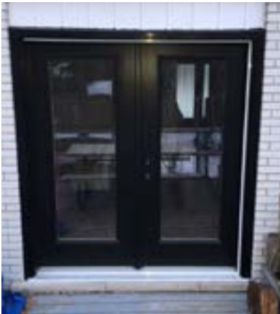
Full Exterior View