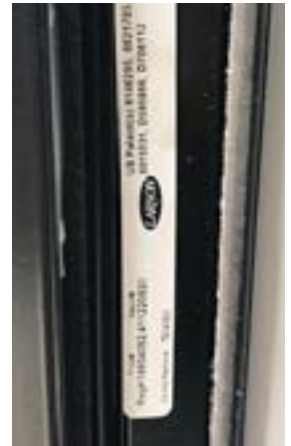
Storm Door Label