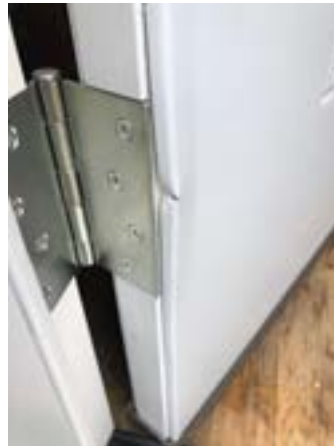
Close-Up of Issue