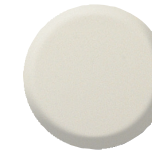
Primed Finger Joint Pine